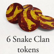
6 Snake Clan tokens