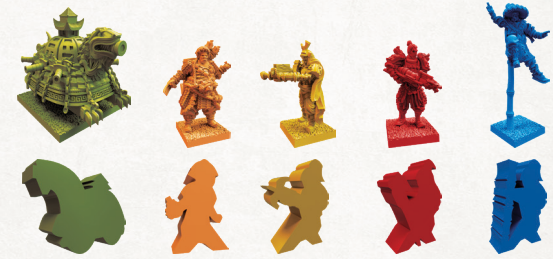
15 Special Soldier (3 for each Clan)

Depending on your version, your game will contain meeples or miniatures