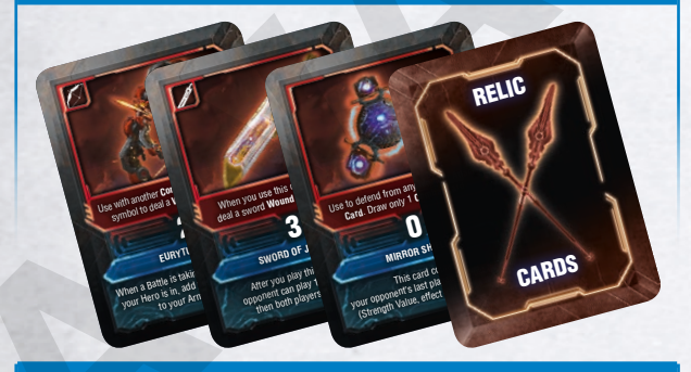
5 NEUTRAL ARTIFACT CARDS