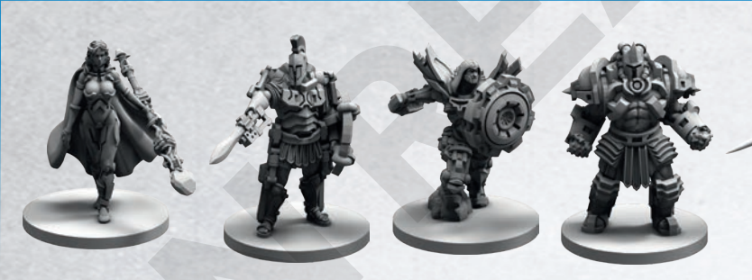
60 HOPLITES (15 PER PLAYER), 16 PRIESTS (4 PER PLAYER)